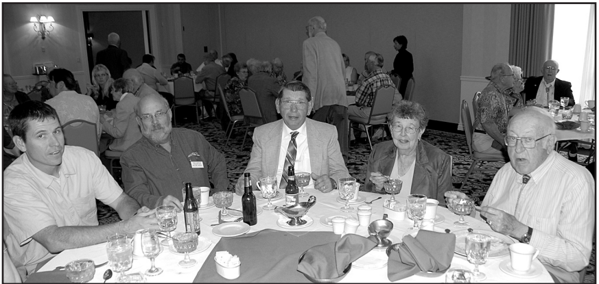
Banquet guests.