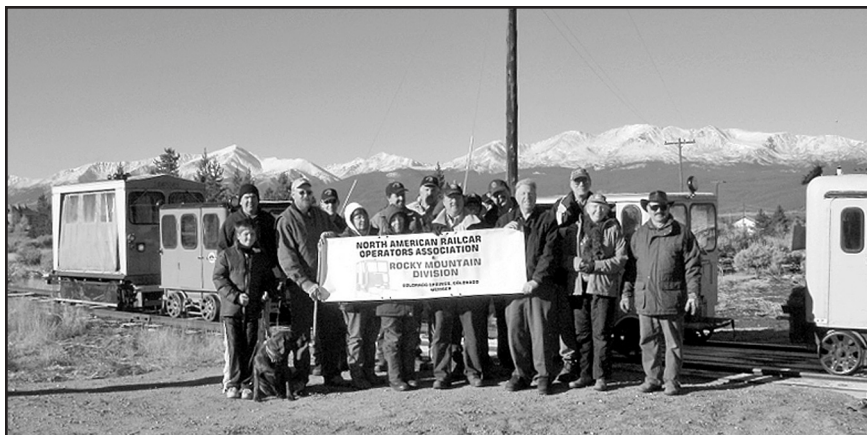
Rocky Mountain Division of the North American Rail Car Operator's Association members in the LC&S Railroad yard.