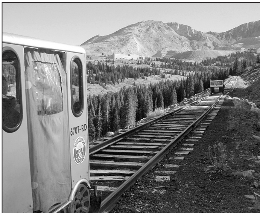
Two motorcars on the LC&S rails with the Climax Mine in the background.

Everyone made it to the end of track despite the ice on the tracks! We again began our return trip back to Leadville with a stop to look at a discarded boiler left over from earlier days of the mining and logging that took place in the area.