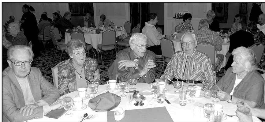
Banquet guests.