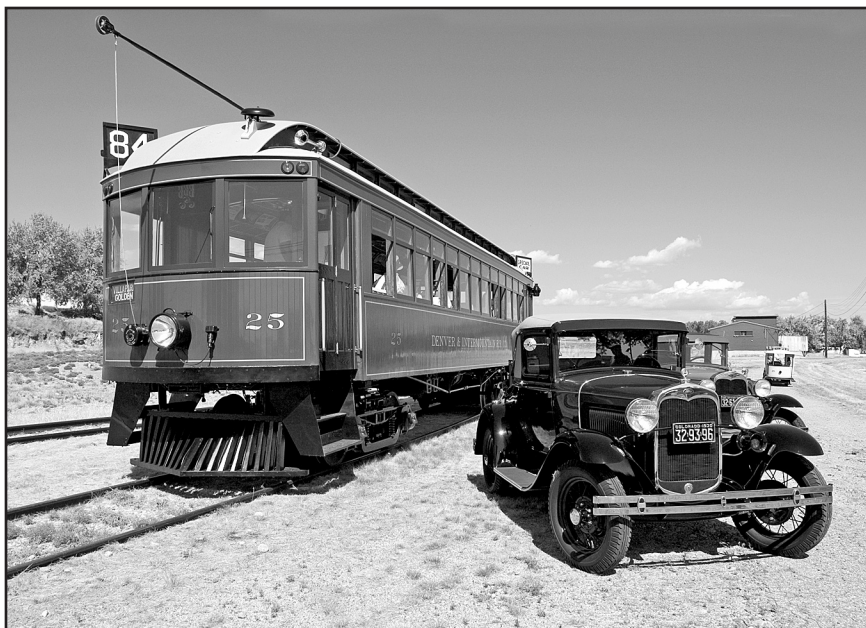
No. 25 at the open house and rollout on 8/18/07.